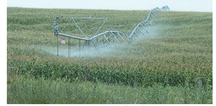
Corn is one of the most tested crops for effect of phosphite application, with contrasted and sometimes controversial results.

conclusions from German researchers is a key point indeed! Phosphite may go undetected by most agricultural testing laboratories that are set up to test for orthophosphate. So far, approved techniques for fertilizer testing only measures orthophosphates. However, some non-regulatory laboratories are switching to inductively coupled argon plasma technology for rapid analysis of several elements simultaneously. This technology has the capability of measuring total P whether orthohosphate, phosphite, or solubilized organic P. If this technique were used to measure total P, it could create the impression that plant-available P is higher than it really is if some of this P was phosphite. Testing for the phosphite anion alone is tedious and expensive but it may be the price to pay for a better transparency in the market. In